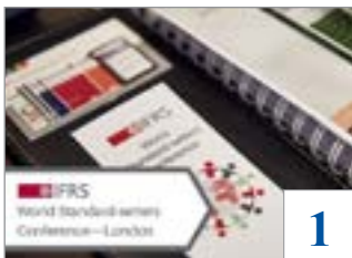
1 IASCA Participates in the World Standard-Setters Conference