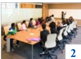
2 Training Courses of October 2019