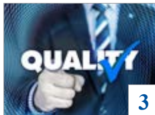
3 Research Shows Benefits of Multidisciplinary Firm Structure in Producing High Quality Audits