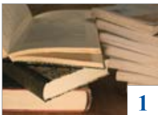
1 IASCA Takes Part in the 19th Amman International Book Fair