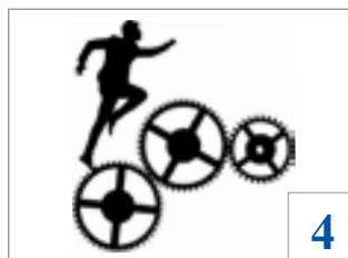
4 New Report Highlights Accountancy Profession as Key Driver of Progress in Adoption of International Standards